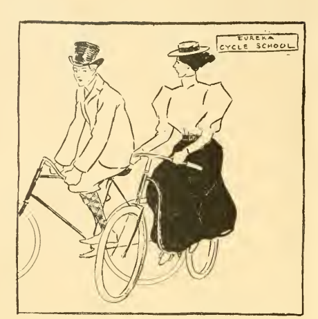
"HE DROVE ALL THE LADIES TO WEARING THOSE ODIOUS PSYCHE KNOTS.

luxnry to wear these clothes. Old flannel shirt, old coat, old pair of tronsers shortened to the knee, and golf stockings. I've had these golf stockings two years, and never had a chance to wear 'em till now,